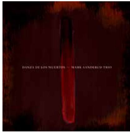
DANZA DE LOS MUERTOS