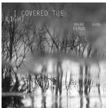
I COVERED THE LIGHT