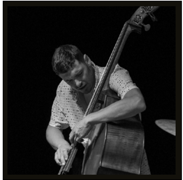
BORIALBERO DOUBLE BASS