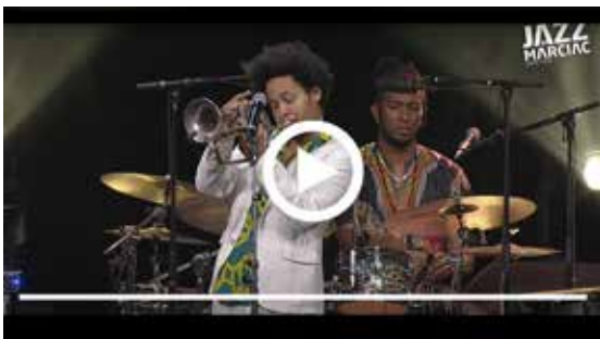
EL COMITÉ | JAZZ IN MARCIAC