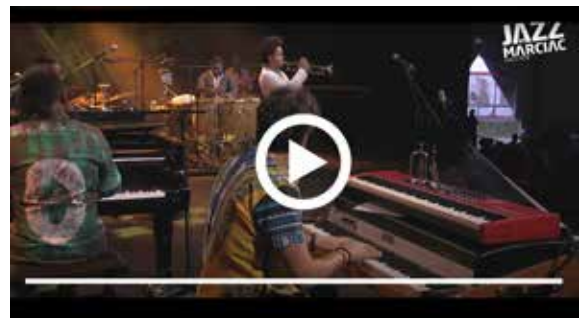
EL COMITÉ | JAZZ IN MARCIAC