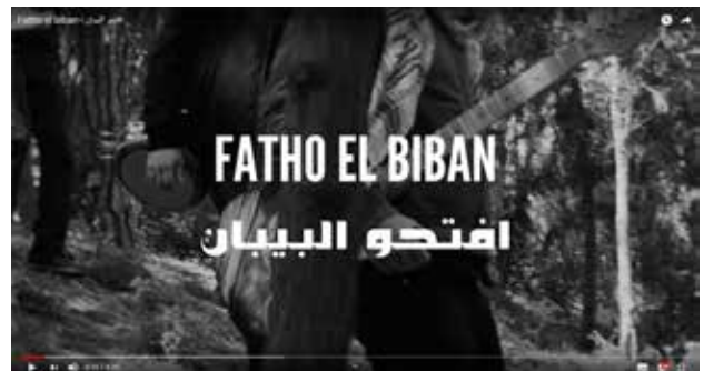
FATHO EL BIBAN | Videoclip oficial