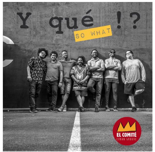
[Y QUÉ?! SO WHAT 2019]

Considered as part of the greatest & most renowned Cuban musicians of their times, this band of seven had the excellent idea to be on stage together in October 2017 in Toulouse. All of them being impressive composers, arrangers and soloists it was crucial for each of them to quickly find its place so as to reach the balance and cohesion needed for such a short delay recording. The nine titles composing this album entitled "Y que!?" (So What)" reflects the diversity of influence and rhythms of El Comité, Afrobeat, funk, latin jazz, lulla-by... a "cuban groove siglo 21"