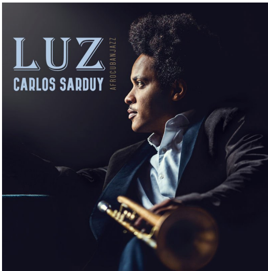
[[LUZ · BALAIO RECORDS 2019]

A vibrant album that offers freedom and musical versatility in a natural and very personal way.